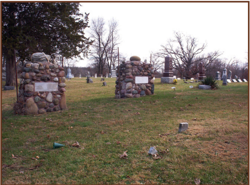
Chockley Cemetery, #5, Southeast Loop