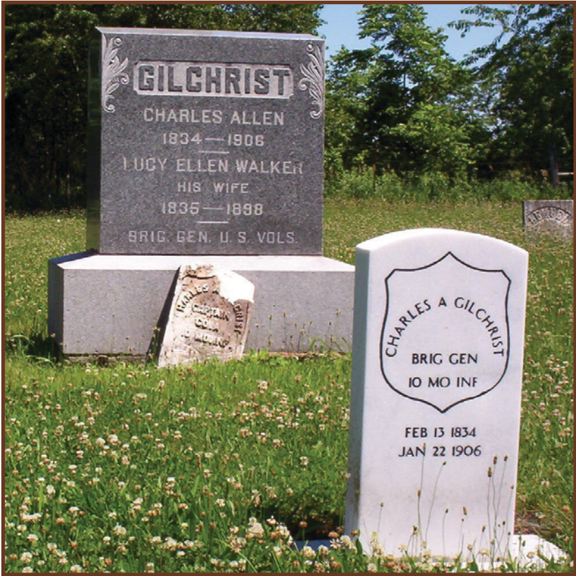
Arberghast-Pearce Cemetery, #2, Northeast Loop Brigadier General Charles Gilchrist, Civil War